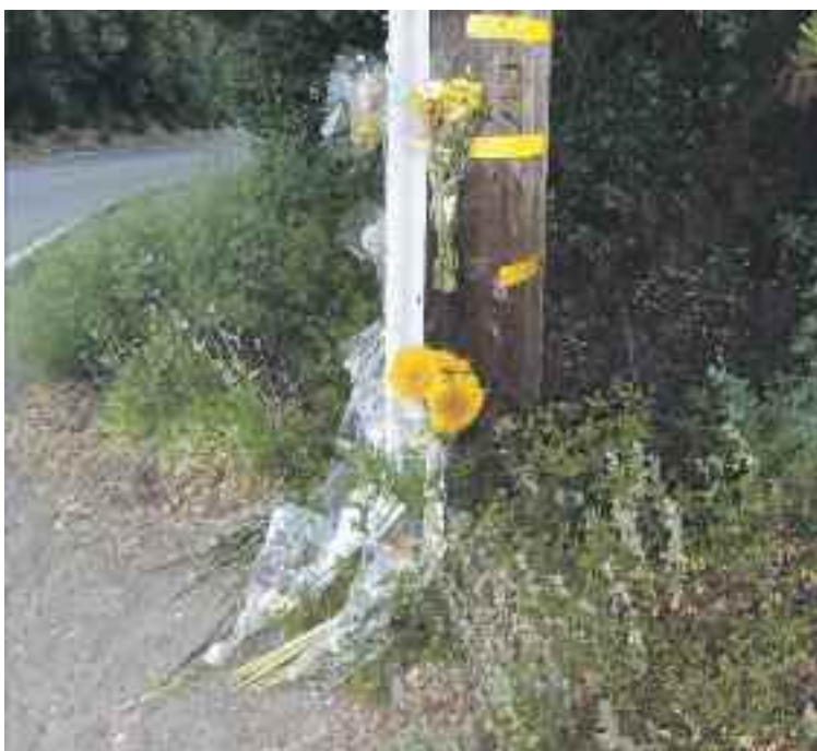
Makeshift memorial for the deceased at the corner of El Nido Ranch Road and Upper Happy Valley Road.

An elderly woman from Pleasant Hill was struck and died June 17 at El Nido Road and Upper Happy Valley Road in the middle of the afternoon by a dump truck driver who didn't see her. The driver was shaken and upset when taken in for questioning by police; he fully cooperated and had no signs of drug or alcohol impairment, or use of a cell phone at the time of the accident. The deceased was well known in the area, with grown children and grandchildren living in Lamorinda.